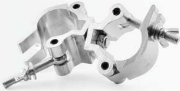
500Kg Double [F0000006]